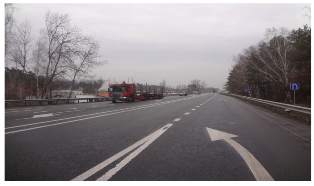
Figure 2 – Pavement condition on road Kiev – Kovel (km 33+100, Vorzel)

Examples of asphalt concrete pavements with natural bitumen additive are shown on figure 2-3.