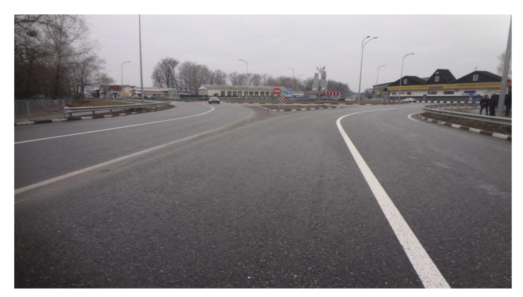
Figure 3 – General look, approach to the roundabout, Borodyanka

Comparison of properties of various types of bitumen modifiers is shown in table 6.